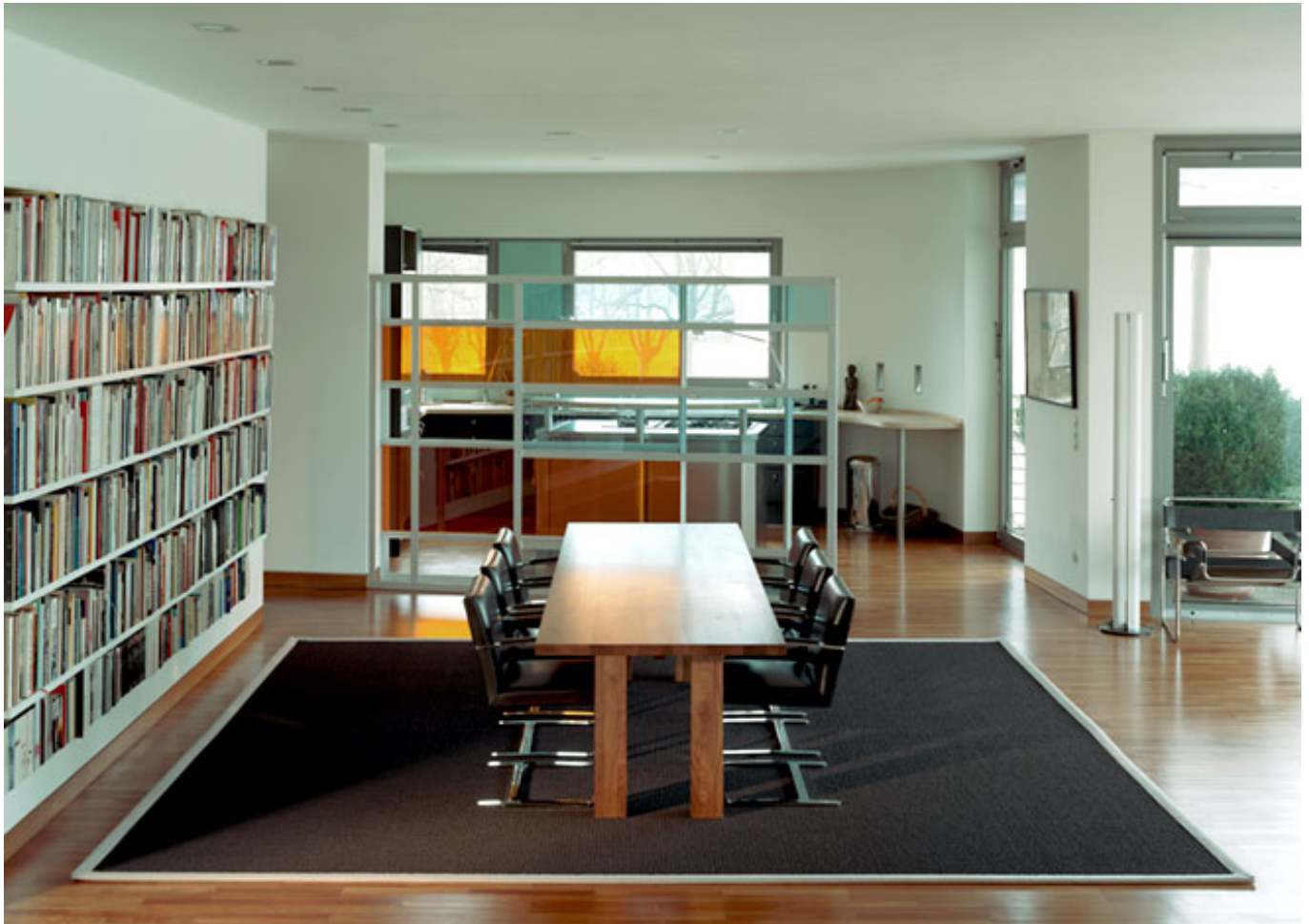
Calicut 617 indigo