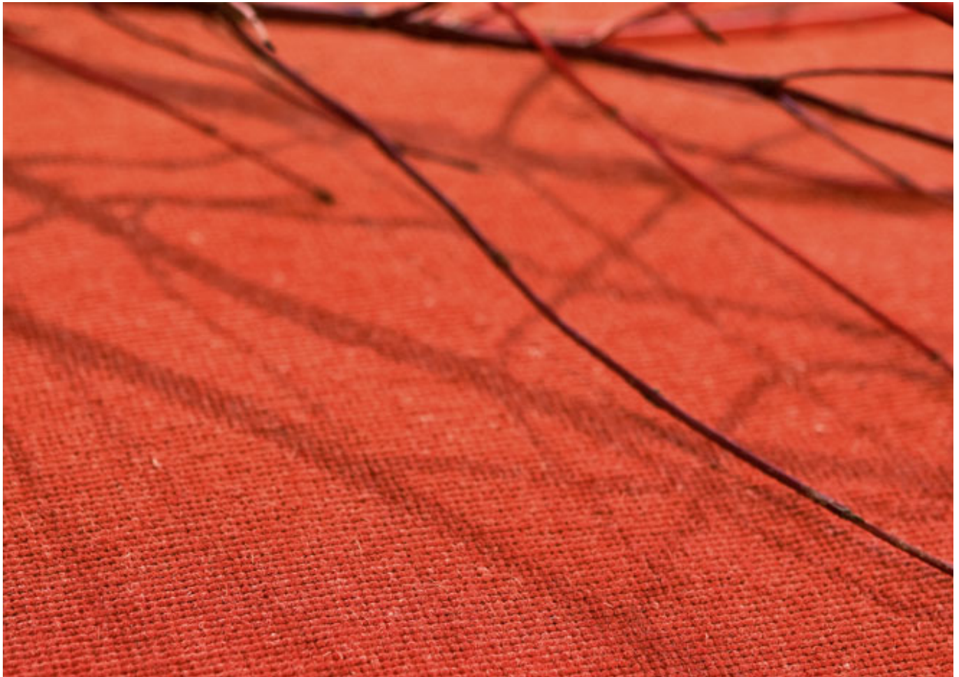
Flatwool Simple 122