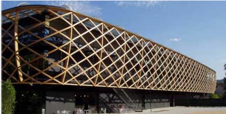
Hugo Boss, Coldrerio, Switzerland